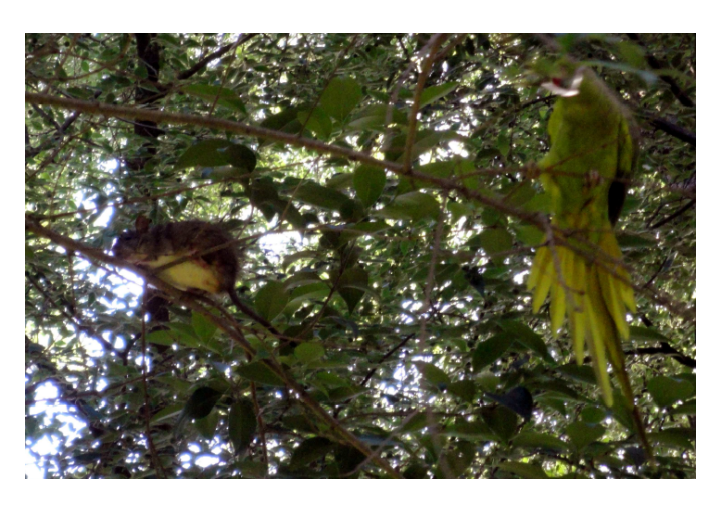
Figure 1 – Instance of a black rat persecuted and attacked by a rose-ringed parakeet in Maria Luisa Park, Seville, May 25 2013. Darkness prevented a better quality image.